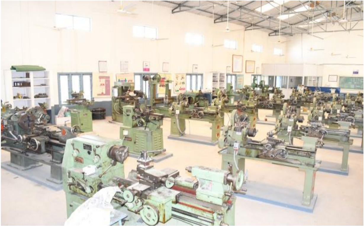
Over view of Machine Tools Lab