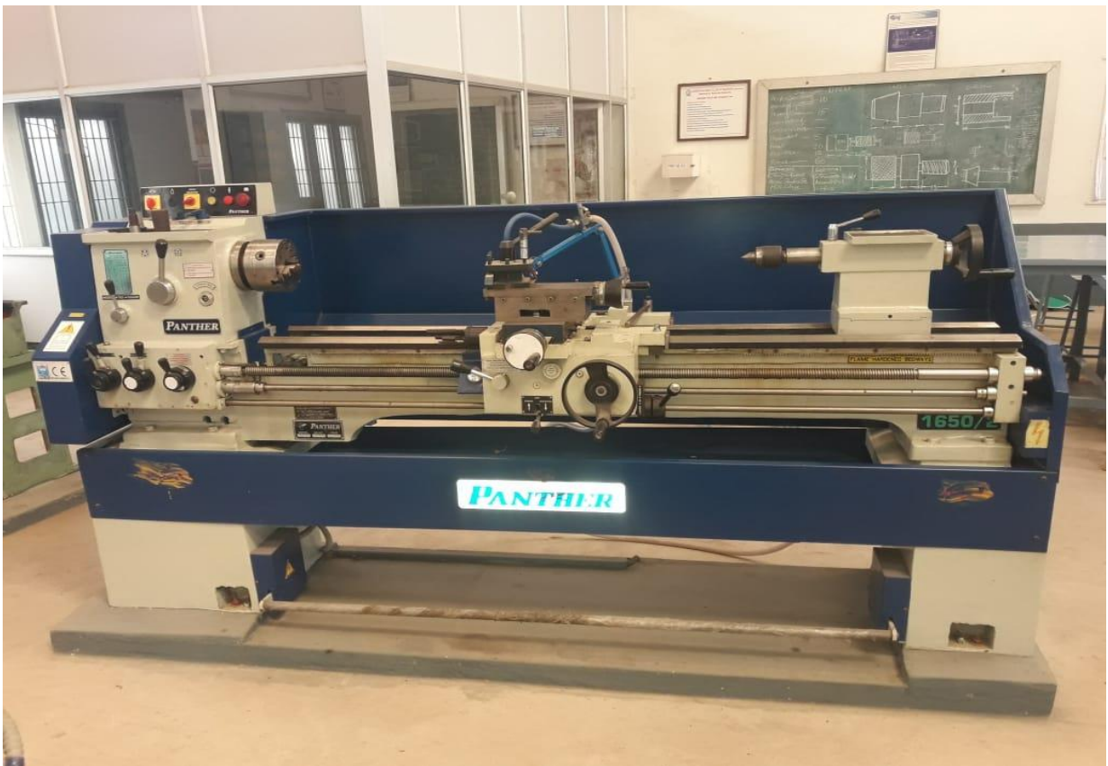
All Geared Lathe