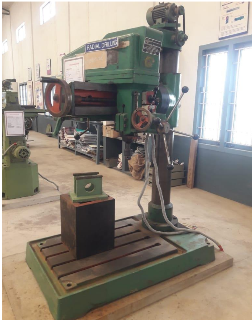
RADIAL DRILLING MACHINE

Stroke : Adjustable stroke ( 10-150 mm ) Longitudinal movement : 200 mm Cross movement : 110 mm Speed adjustment : 3 speeds Ram adjustments : 150